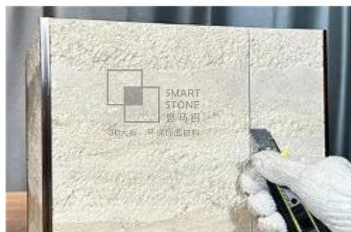
④若产品不齐平可用刀片调整 Uneven parts can be adjusted by blade