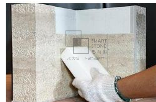
⑥用干海绵清理表面，完成 Clean the surface with a dry sponge and complete