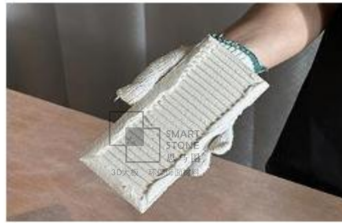
②产品背面边缘刮浆角度成45°，浆面高度 约高于平面3mm The product scraping angle of the back edge is 45° , and the height of the slurry surface is about 3mm higher than the plane