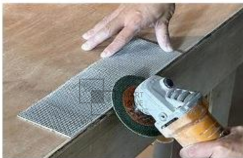
①对角处产品边缘作45° 修边 45° edge trimming of the product at the diagonal corner

Tools required: angle grinder, small shovel, grinding wheel, same color joint filler or paste, brush, clapper, dry sponge