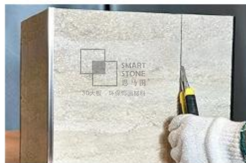
⑤固定缝宽后，用小刀片划下刀片缝（自然缝） After fixing the gap, using the blade to cate the blade seam (natural seam)