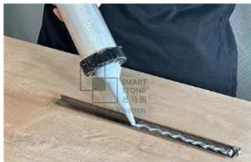
②在收边条粘贴面均匀涂上结构胶 Apply silicon glue evenly on the adhesive surface of the edge strip