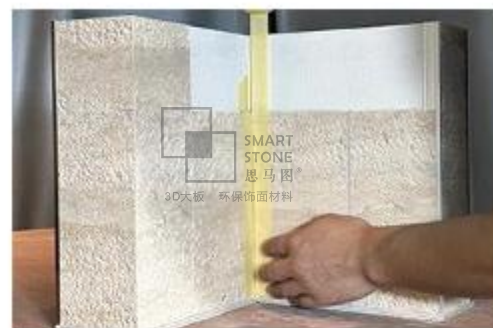
②产品两侧粘贴美纹纸 Paste masking paper on both sides of the product