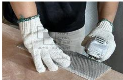
①用角磨机在产品毛糙边缘修边 Trim the rough edges of the product with angle grinder

Tools required: angle grinder, 1mm seam cutter, small blade, dry sponge