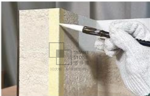
⑦用毛笔蘸取同色填缝剂或色浆进行修色 Dip a brush in the same color slurry or color paste for color correction