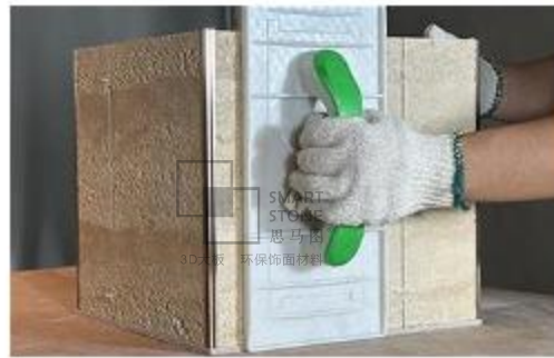
⑧用拍板压实产品, 严禁用手按压 Compacting the product with clappers and prohibited with hands