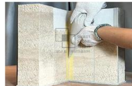
③均匀填缝 Uniform joint filling