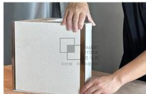
③粘贴收边条 Paste edge banding