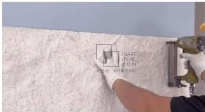
⑤打钉加固 nailing reinforcement