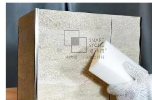
⑥用干海绵清洁表面，完成 Clean the surface with a dry sponge and complete