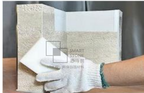
⑧用干海绵清理表面，完成 Clean the surface with a dry sponge and complete