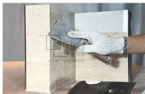
⑤若浆料没填满缝隙，可用填缝剂填补缝隙 If the slurry does not fill the gap, the gap can be filled with caulk