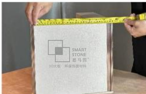
④安装收边条后测量产品实际上墙尺寸 Measure the actual wall size of the product after installing the edge strip