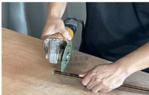
①用手持切割机或木工台在标记位置切割 Cut at the marked position using a handheld cutting machine or woodworking table

Tools required: metal edge banding (thin sintered tile edge banding can be used), angle grinder, small blade, mark pen, handheld cutting machine or woodworking table, silicon glue, guiding ruler, clapboard