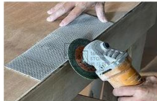
⑥用角磨机研磨产品边缘, 使边缘平整 Grind the edges of the product with an angle grinder to make them flat