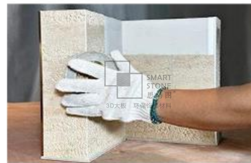
⑥半干后用砂轮片打磨边缘，使边角更平整 After half drying, use a grinding wheel to polish the edges to make the corners smoother