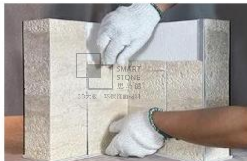
①阴角处产品左搭或右搭粘贴即可 Simply stick the product on the left or right side at the inner corner

Tools required:masking paper, same color seam sealer, seam filling bag, dry sponge