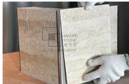
②根据尺寸粘贴两侧产品 Paste products on both sides according to size