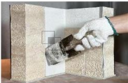
④用小铲刀铲除溢浆 Use a small shovel to remove the overflow