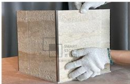
⑦产品沿收边条边缘粘贴 Paste the product along the edge of the edge strip