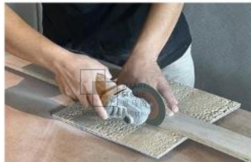
⑤按照尺寸切割产品 Cut the product according to size