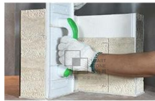
③粘贴完成后，用拍板压实产品，严禁用手 按压 Compacting the product with clappers and prohibited with hands after pasting