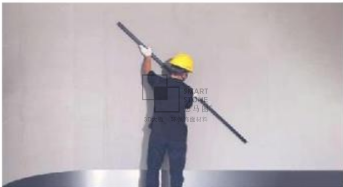
①基层验收 base acceptance

标准基底: 硅钙板、水泥纤维板、水泥基底 旧瓷砖/大理石基层: 上界面剂后即可铺贴产品