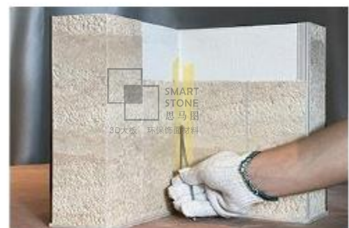
④用勾缝条拉出深凹、饱满的缝 Pull out deep and full seams with a pointing strip