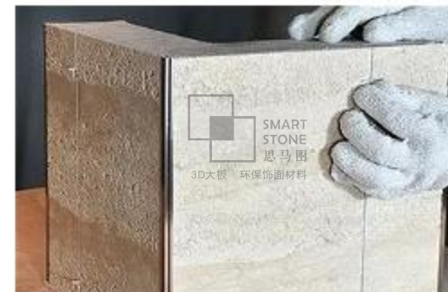
③粘贴后用1mm卡缝器卡缝，固定缝宽 Use 1 mm sewing machine to sew and fix the seam while pasting