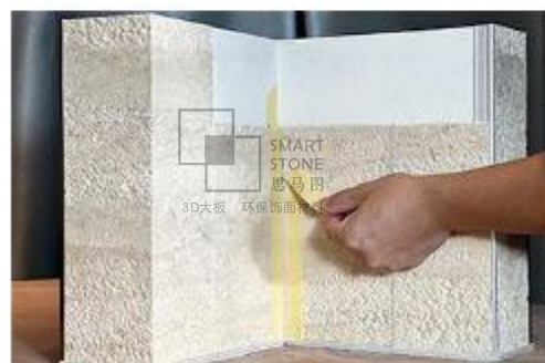
⑤干透后撕开美纹纸 Tear open the masking paper